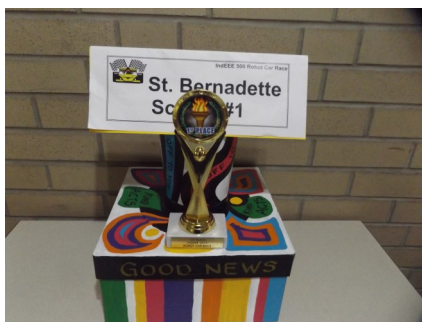
The 1st place trophy!